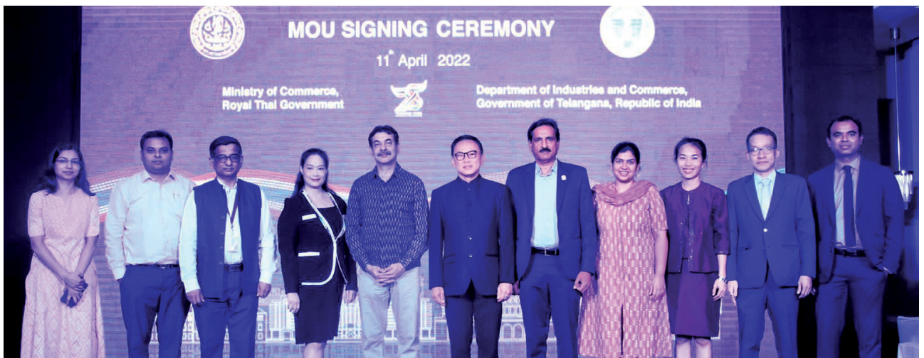
The Department of Industries & Commerce, Government of Telangana & the Ministry of Commerce, Royal Thai Government entered into a Memorandum of Understanding today : 11th April, 2022 at ITC Kohenur Hotel, Hyderabad